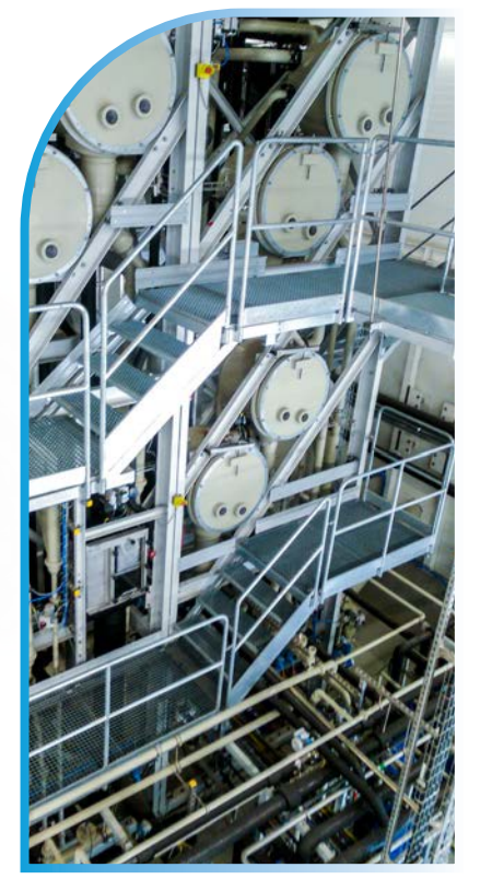
LTD low temperature distillation Doosan Hungary / Hungary