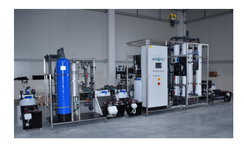
Figure 6 - The 250 m3/day system awaiting delivery